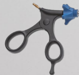
300-450-300 PEEK Polymer Handle, blue rotating wheel, without ratchet